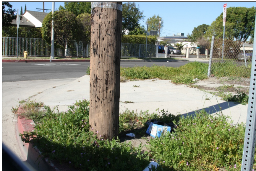
Figure 5. Single-family residences in the background of alcohol-related litter shown in Figures 3 and 4.