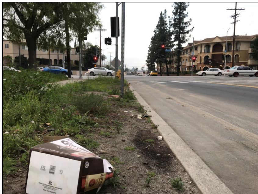
Figure 7. Litter: Corona beer 12-pack box at southeast corner of Woodman Av and Filmore Street; in front of single-family home. February 27, 2019.