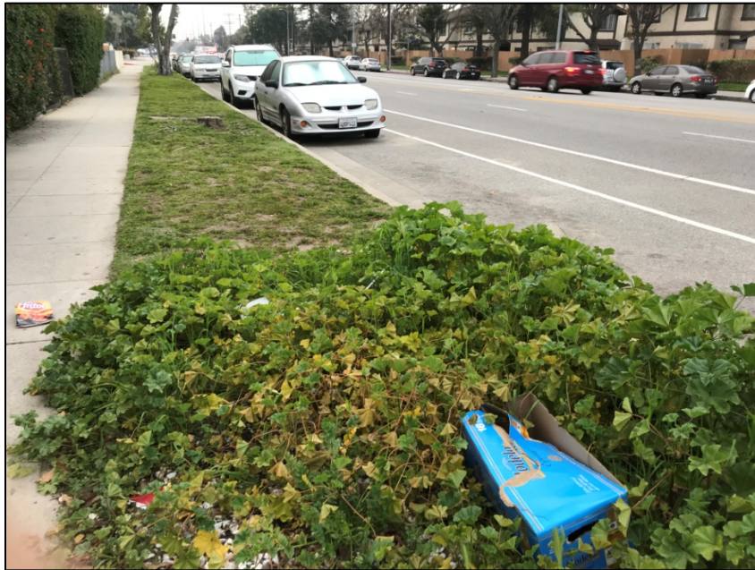
Figure 8. Litter: 12-pack box of Modelo beer at 9800 mid-block of Woodman Avenue in front of single-family home between Van Nuys Blvd and Lassen St. February 27, 2019.