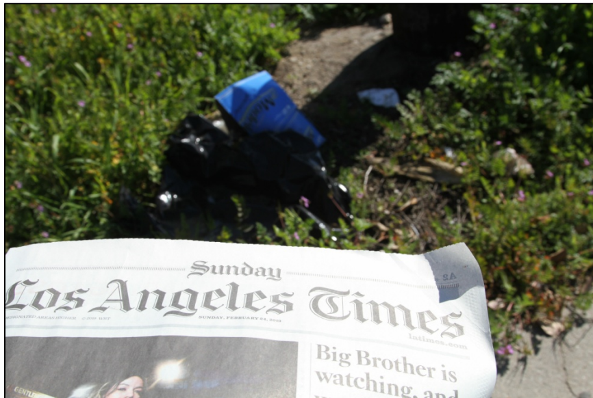
Figure 3. Litter: 12-pack box of Modelo beer at northeast corner of Kagel Canyon Street and Canterbury Avenue. February 24, 2019.