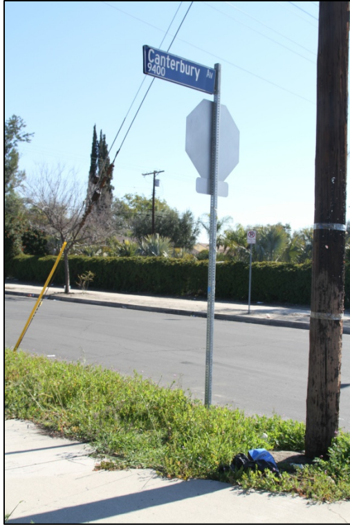
Figure 4. Same alcohol-related litter shown in Fig. 3