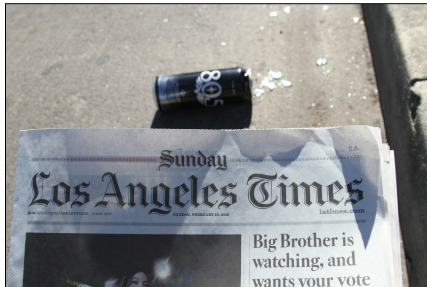
Figure 1. A can of 805 beer is in front of a single-family home in Arleta. February 24, 2019.

The Mayor's Office, City Council, and its Committees must maintain the current CUB entitlement process, implement an expedited revocation process for nuisance ABC establishments, hire more code enforcement officers, and have an opt-out program for communities that do not wish to participate in RBP should the standards get adopted despite the opposition to them here, and require a public hearing requisite for all CUB applicants.