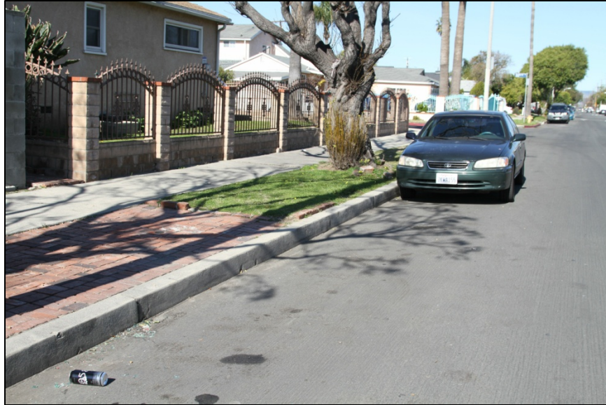
Figure 2. Same beer can in Fig. 1 at southwest corner of Sunburst Street and Beachy Avenue.