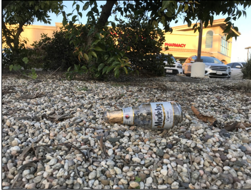
Figure 6. Modelo beer bottle at Walgreens, 9750 Woodman Ave on February 25, 2019.